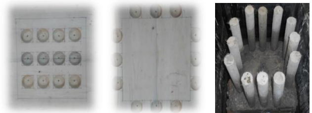
Fig. 4. Fixity plates

treatment beneath the structure’, a wooden fixity plate of thickness equal to 0.0508 m (or 2 in) was provided and fibre-reinforced soil-cement columns were fixed at 0.0254 m (or 1 in) inside the fixity plate in order to attain the fixity condition. In the case of ‘treated 1-g physical model-II with treatment adjacent to structure’ a soil-cemented fixity plate of thickness equal to 0.127 m (or 5 in) was provided, the columns were fixed 0.1016 m (or 4 in) inside the fixity plate. The fixity plates were used in order to prevent the columns from rotation and displacement. After the provision of fibre-reinforced soil-cement columns vertically in liquefiable surface loose layer of sand underlain by the non-liquefiable bottom layer of dense sand, the filling of sand for remaining 0.4826 m (or 19 in) height was carried-out. So, the total filling of sand was up-to 0.6096 (or 24 in) comprising of 0.3048 m (or 12 in) non-liquefiable bottom layer of dense sand and 0.3048 m (or 12 in) liquefiable surface layer of loose sand. The structure was placed at the top of liquefiable surface layer of loose sand and finally the equipment’s were installed.