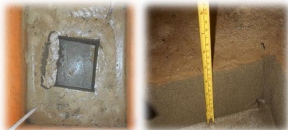
Fig. 5. Penetration of structure inside the ground after the application of dynamic loading

The shallow foundation was constructed upon untreated liquefiable surface loose layer of sand which was underlain by the non-liquefiable bottom layer of dense sand. The shaking table was operated manually and model was examined. Measurements of penetration of structure inside soil and settlement from each side of the structure were taken after shaking Fig. 5. The results were very un-satisfactory, e.g. average settlement value of structure was 0.152 m (or 5.975 in) and average penetration of structure inside liquefiable soil was equal to 0.108 m (or 4.25 in). These large settlements and penetration of structure were carried while shaking of 1-g physical model due to a shear distortion of saturated liquefiable surface loose layer of sand and due to soil-liquefaction as well. After shaking of 1-g physical model, due to saturated soil stiffness and reduction of strength of soil, soil-liquefaction and associated penetration of structure inside soil and ground settlements were carried out. The results of penetration of structure inside soil, pore-pressure head and ground level or settlement in case of untreated 1-g physical model are shown in Tables 4, 5 and 6.