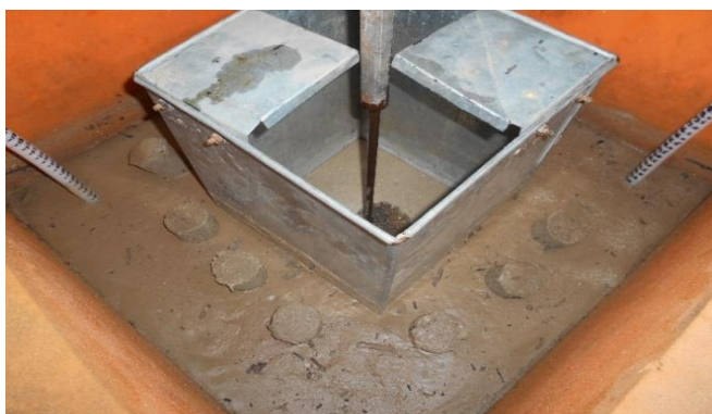
Fig. 6. Columns rotated after the application of dynamic loading