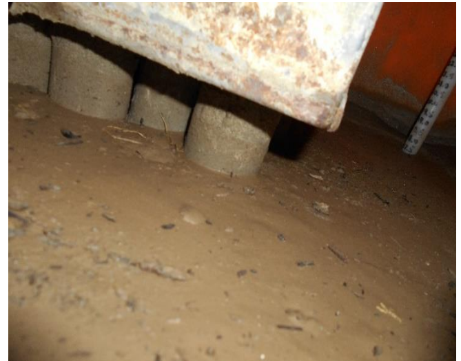
Fig. 12. Absolute intact columns after shaking