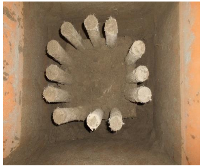
Fig. 11. Columns were un-damaged due to intactness

bottom layer of dense sand and resulted as an effective mitigation measure against soil-liquefaction associated settlement and penetration of structure inside ground. The fibre-reinforced soil-cement columns were un-damaged and intact at their basis due to the provision of sand-cemented fixity plate Fig. 11. This kind of treatment is effective for old (or existing) structures and also effective as retrofitting of existing structure. Recommendation: Some segment of a soil underneath the structure and also nearby the edge of foundation may reduce the settlements up-to tolerable limits and can further reinforce the ground as well. The results of penetration of structure inside soil, pore-pressure head and ground level or settlement in case of treated 1-g physical model-II with treatment adjacent to structure are shown in Tables 10, 11 and 12.