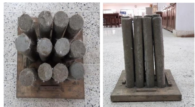
Fig. 14. Columns were un-damaged after shaking