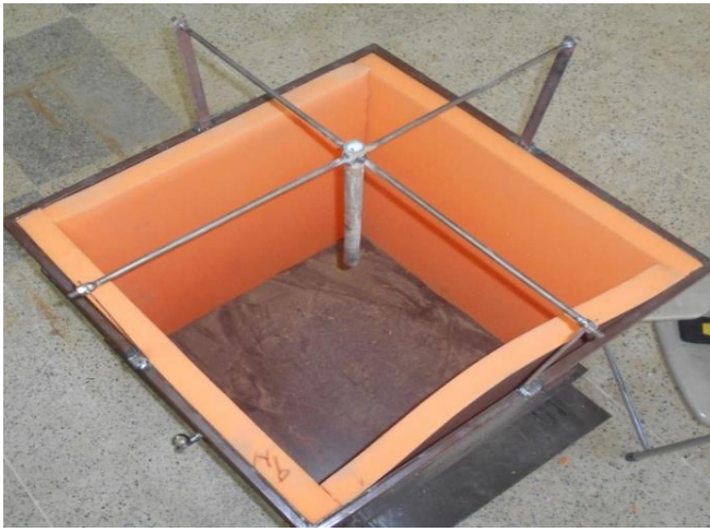
Fig. 2. Energy absorbing boundaries