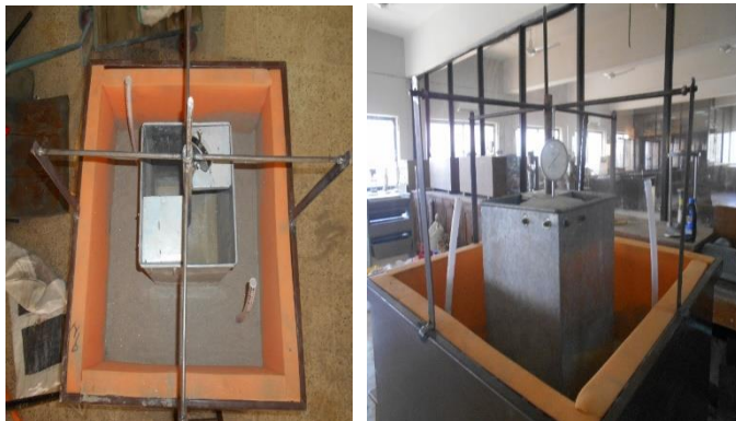
Fig. 3. Installed equipment

This was the 1-g physical model in which there was no any provision of mitigation measure against the soil-liquefaction associated ground settlement. Initially, the sand was poured in to the soil container and then compacted to achieve the relative density equal to 90%, so, that the non-liquefiable bottom layer of dense sand can be achieved. Then the liquefiable surface layer of loose sand was laid above the non-liquefiable bottom layer of dense sand and its relative density was equal to 10%. These two layers of sand were laid, each of 0.3048 m (or 12 in) depth. The structure was placed carefully above the liquefiable surface layer of loose sand and finally the equipment such as piezometers, strain gauge, and the cross bar assembly were installed Fig.3.