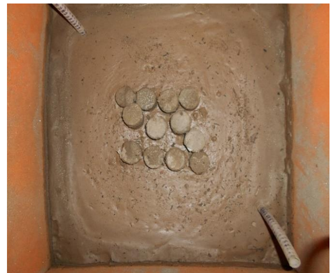
Fig. 13. Penetration of structure inside the soil was negligible after shaking