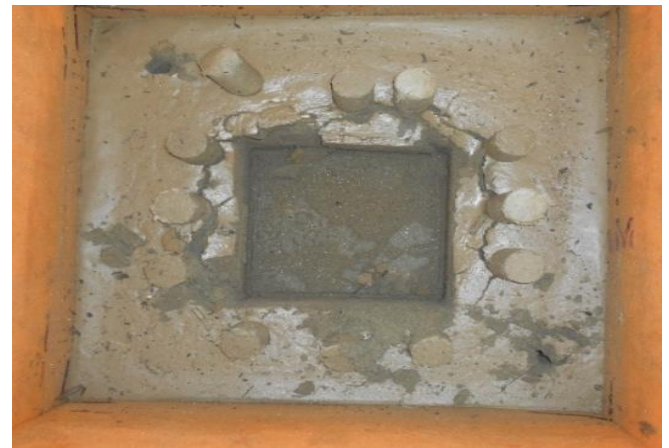
Fig. 7. Penetration of structure inside the ground after shaking