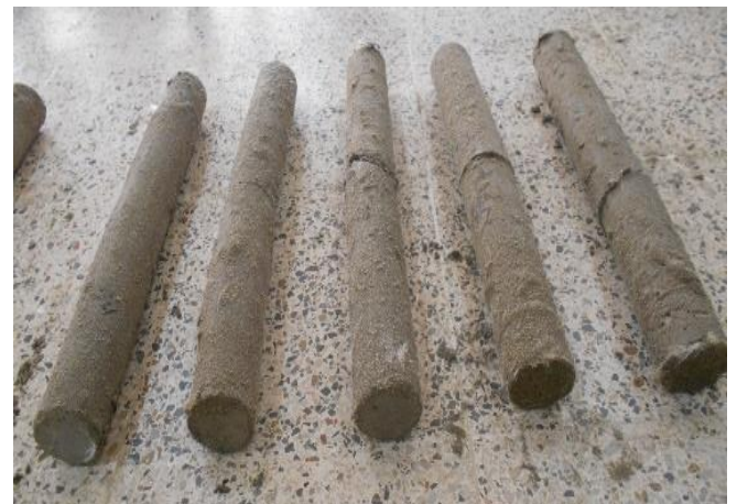
Fig. 8. Damaged Columns after the Application of Dynamic Loading