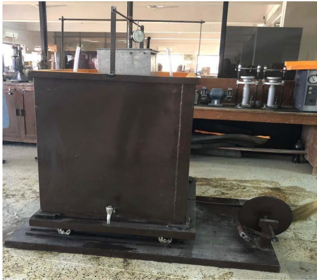
Fig. 1. Shaking table

equal to 244.6522 N and dimensionally it was equal to; L \times W \times H = 0.3048 \times 0.3048 \times 0.4572 \text{ m}^3 . The frequency and amplitude of dynamic loading were equal to 0.5 cycles per second and 0.0254 m (or 1 in), respectively. Therefore, half motion was achieved in 1 second and full motion was achieved in 2 seconds. The effects of acceleration, amplitude, displacement, and frequency were the actual milestones to be achieved after dynamic loading that lead towards the succession of the model. The shaking table test was carried out under 1-g motion and it was an experimental setup in order to simulate the behavior of constructed structure and also the freedom of response by applying dynamic loading, manually.