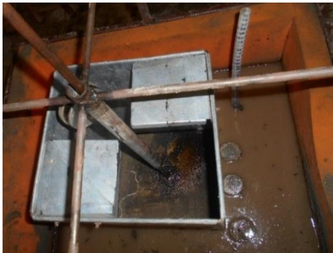
Fig. 9. Columns were intact after the application of dynamic loading