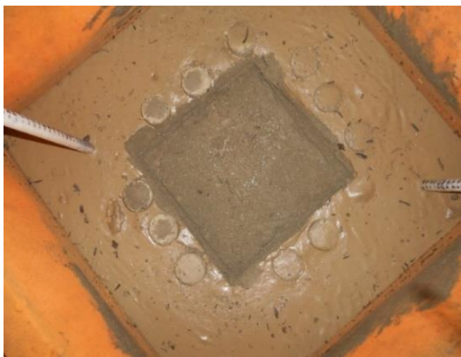
Fig. 10. Penetration of structure inside the soil was negligible after shaking