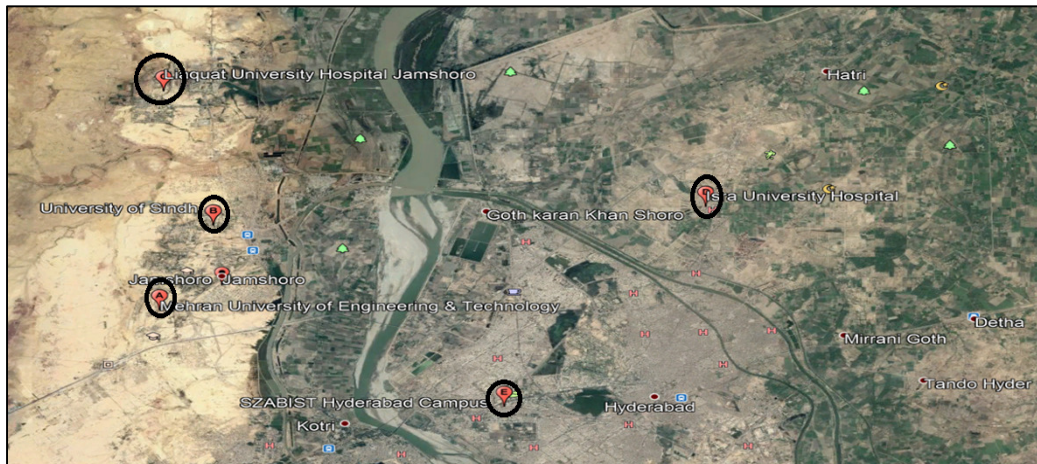
Fig. 1: Google Map representing the 5-HEIs of Jamshoro and Hyderabad, Sindh Pakistan included in the Study

LUMHS1-5, IS1-5 and SZABIST1 due to ethical concerns.