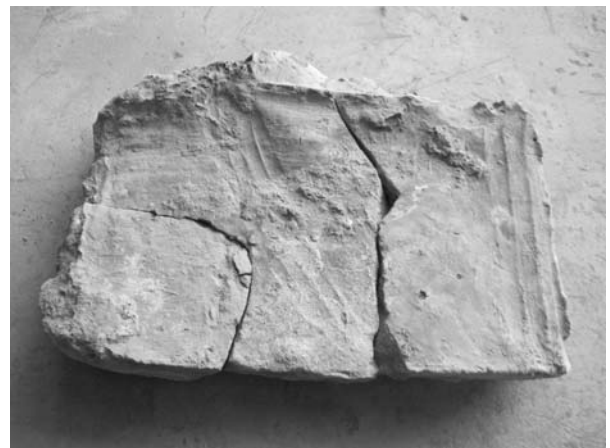
FIG. 3. BAKED CLAY BRICK COLLECTED FROM BARA HAZARI