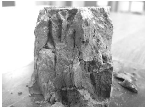
FIG. 7. CUBE CUT FROM BAKED CLAY BRICK OF BARA HAZARI AND TESTED IN UNIVERSAL TESTING MACHINE

The values of tensile strength of old baked clay bricks of Indus valley civilization of tenth century were compared with the corresponding values of modern baked clay bricks