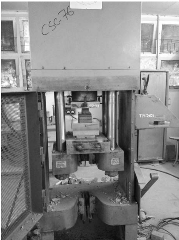
FIG. 6. TESTING OF CUBE CUT FROM BAKED CLAY BRICK IN UNIVERSAL TESTING MACHINE

The results of compressive strength of old baked clay bricks of Indus valley civilization of tenth century were