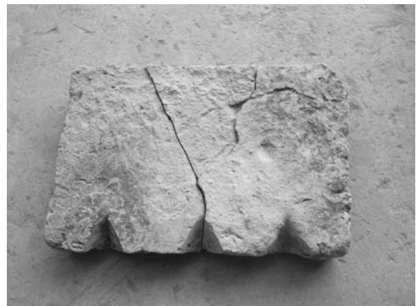
FIG. 2. BAKED CLAY BRICK COLLECTED FROM DAIM PIR