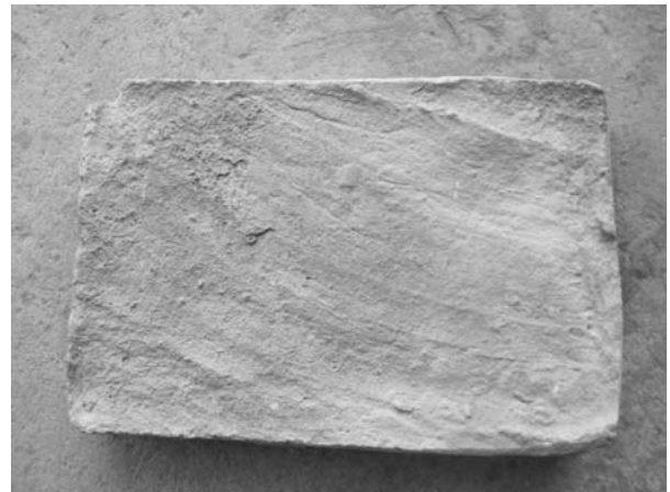
FIG. 1. BAKED CLAY BRICK COLLECTED FROM JARKUS

specimen was cut from each brick: (i) 50mm Cubes, (ii) briquettes having neck section equal to 25x25mm (iii) small beam section 50x50x225mm.